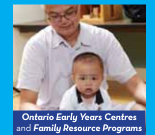
Ontario Early Years Centres and Family Resource Programs