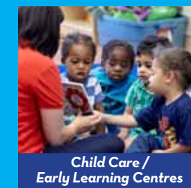
Child Care / Early Learning Centres