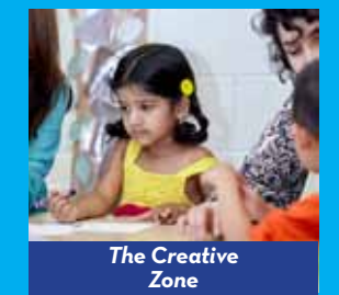
The Creative Zone

CHILDREN IN CARE APRIL 2014 TO MARCH 2015