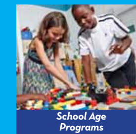
School Age Programs