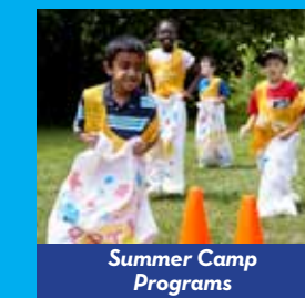
Summer Camp Programs