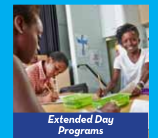
Extended Day Programs