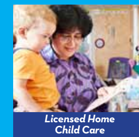
Licensed Home Child Care