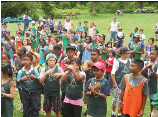
Summer Fun at Boyd Park Day 2012

Flyers will be available at all school age programs on Monday March 18. Registration is by mail, first come, first served.